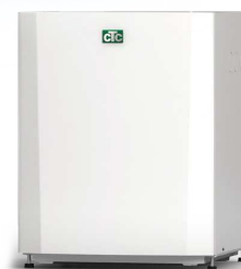
CTC EcoPart 406-412, 612M-616M