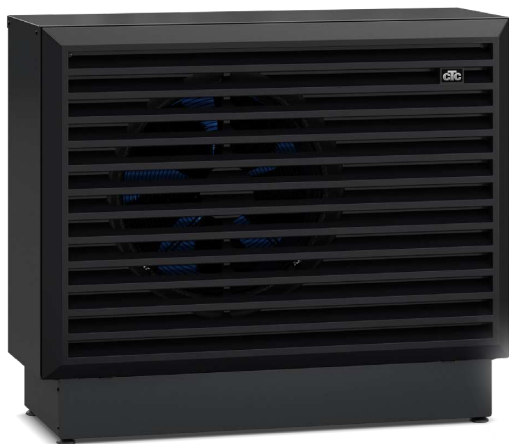
CTC EcoAir 700M

– refer to individual product sheets for more detailed information.