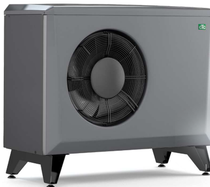
CTC EcoAir 406-408, 510M-622M